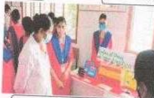
Routes of Drug Administration