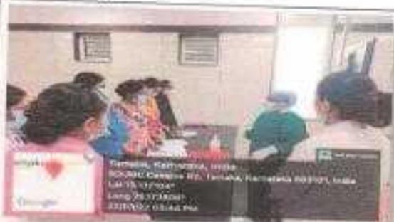
Tamaka, Karnataka, India 50480 Gangolli Rd, Tamaka, Karnataka 563103, India Lat: 13.130241° Long: 76.172774° 22/09/22 04:12 PM