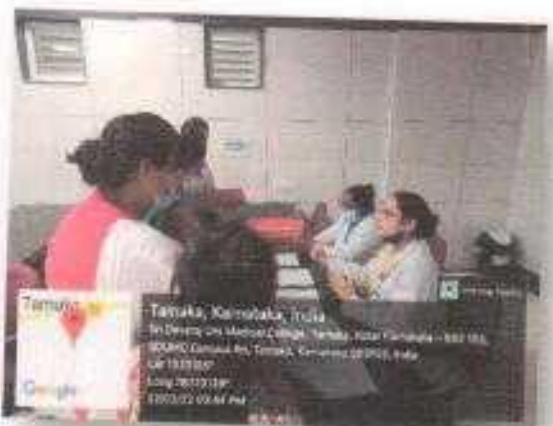
Tamaka, Karnataka, India Sri Devaraj Urs Medical College, Tamaka, Kolar Karnataka - 563103, India 50480 Gangolli Rd, Tamaka, Karnataka 563103, India Lat: 13.130241° Long: 76.172774° 22/09/22 04:14 PM