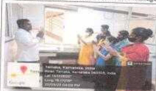
Tamaka, Karnataka, India 50480 Gangolli Rd, Tamaka, Karnataka 563103, India Lat: 13.130241° Long: 76.172774° 22/09/22 04:12 PM

Photo-Gallery of Hands on Skill training one. Handwashing, 2.PPE donning doffing, 3.Safe infusion practices, 4. Biomedical waste management, 5.Care Bundles.