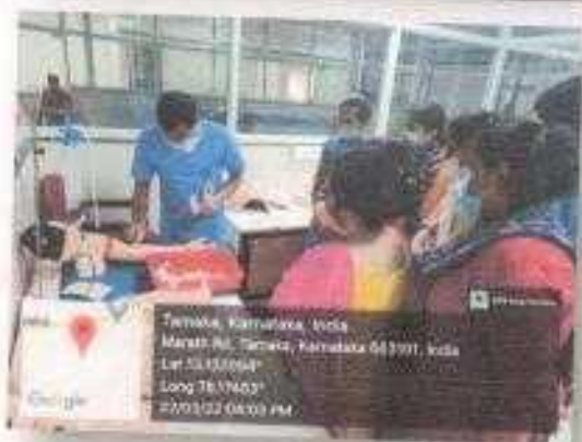
Tamaka, Karnataka, India Marath Rd, Tamaka, Karnataka 563101, India Lat: 13.130241° Long: 76.172774° 22/09/22 04:00 PM