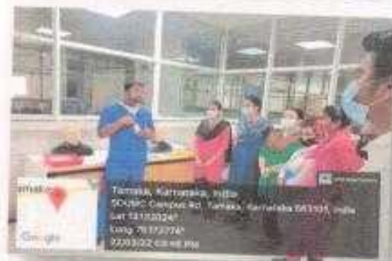
Tamaka, Karnataka, India 50480 Gangolli Rd, Tamaka, Karnataka 563103, India Lat: 13.130241° Long: 76.172774° 22/09/22 04:10 PM