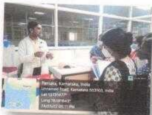
Tamaka, Karnataka, India Unnamed Road, Karnataka 563103, India Lat: 13.130241° Long: 76.172774° 22/09/22 04:11 PM