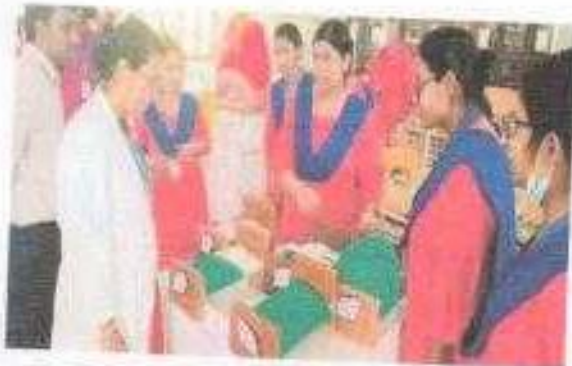
Types of Beds