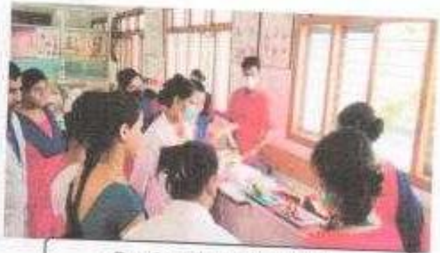
Comfort devices & positions