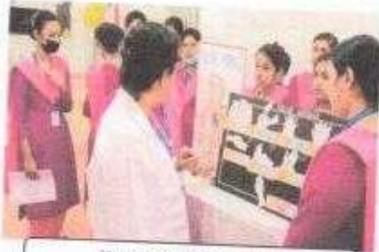
Hand washing models