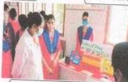
Routes of Drug Administration