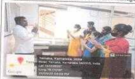
Photo-Gallery of Hands on Skill training one. Handwashing, 2.PPE donning doffing, 3.Safe infusion practices, 4. Biomedical waste management, 5.Care Bundles.