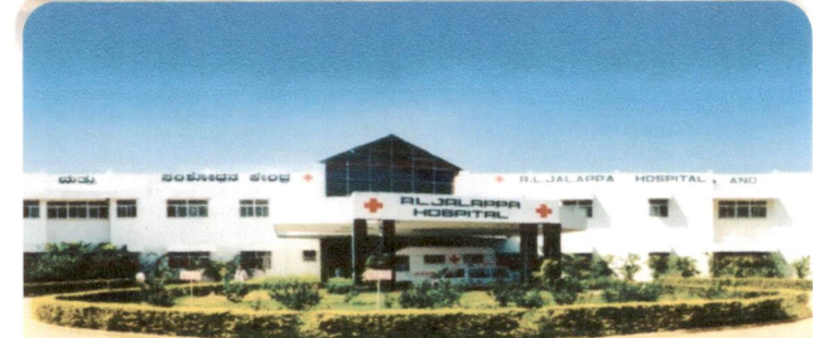
RLJ HOSPITAL & RESEARCH CENTRE