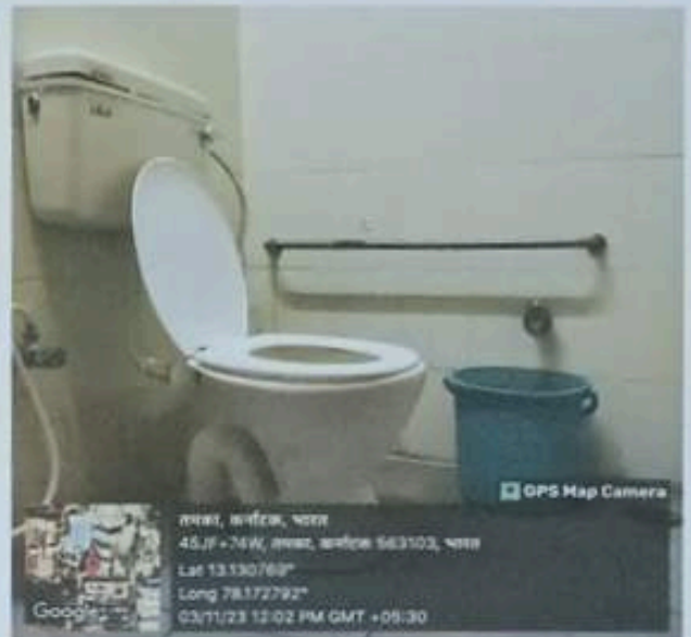
Disable friendly washroom

Tamaka, Karnataka, India 45JF+74W, Tamaka, Karnataka 563103, India Lat 13.130769° Long 78.172792° 03/11/23 12:02 PM GMT +05:30