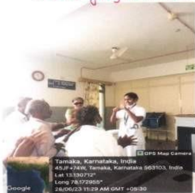
Students giving Health Awareness

Tamaka, Karnataka, India 45JF+74W, Tamaka, Karnataka 563103, India Lat 13.130712° Long 78.172955° 28/06/23 11:29 AM GMT +05:30