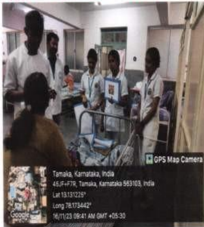
Health Education on Disease Condition

Tamaka, Karnataka, India 45JF+77R, Tamaka, Karnataka 563103, India Lat 13.131226° Long 78.173442° 16/11/23 09:41 AM GMT +05:30